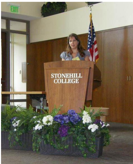
Helga presenting at the conference

The GRS itself was an absolute highlight. The principle of the GRS was to encourage communication and discussion of ideas and results in a smaller, informal setting. Often, younger scientists can be intimidated by the presence of senior scientists at conferences which can result in a failure to participate in open discussion - to the detriment of the science. The GRS is designed to build the confidence of the youngest scientists in a friendly environment prior to the main meeting, to the mutual benefit of both groups.