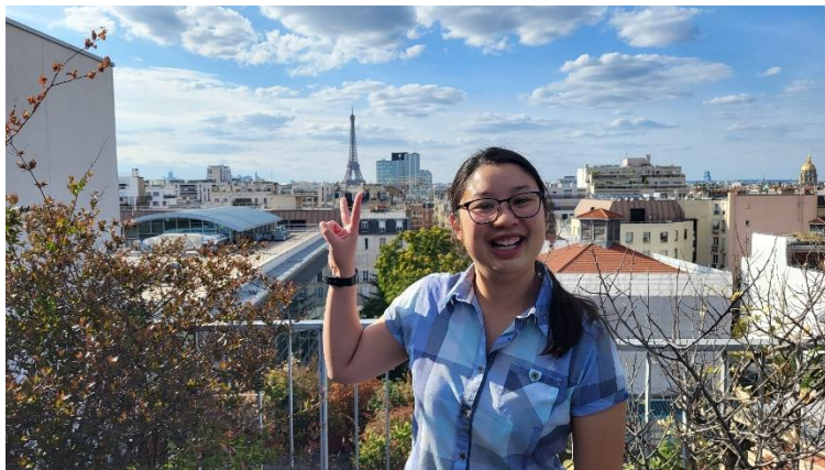
Me in Paris