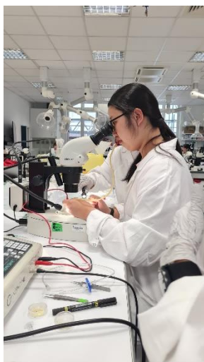
Me electroporating a chicken embryo.