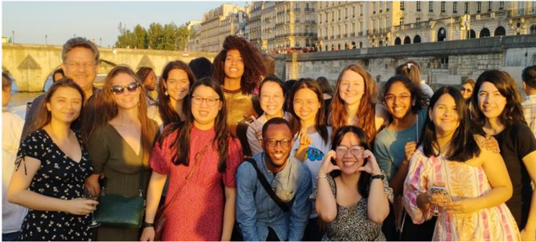
All of the cohort on a beach trip